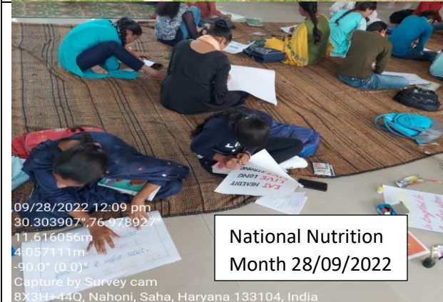
National Nutrition Month 28/09/2022