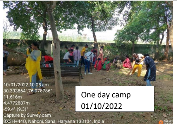
One day camp 01/10/2022