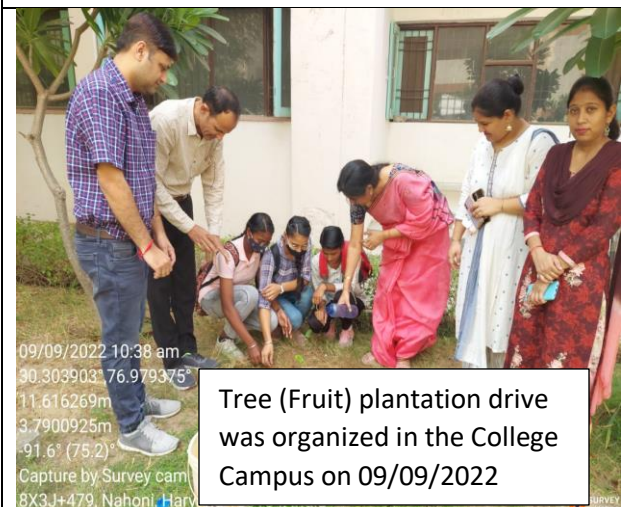
Tree (Fruit) plantation drive was organized in the College Campus on 09/09/2022